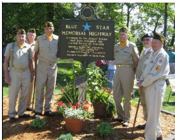
Blue Star Memorial marker dedication Flag Day, June 14 at Lake Huron Roadside Park Horatio E. Earle site on Highway 25 south of Port Sanilac.

"Costs $1200? How can we ever afford this?" asked the Anytown Garden Club's Treasurer! The Club President replied that the National Blue Star Guidelines (12 pages) stated, 'community agencies would welcome the opportunity to be included.' Four months later, after speaking to groups on behalf of Blue Star, the Anytown Club received funding from three groups, each providing 1/4th of the total cost. With this powerful support, the Blue Star program was well on its way to a successful dedication. Furthermore, Anytown Garden Club reaped the benefits of community outreach and received long term gratitude for having sponsored this program that paid special tribute to the Armed Forces.