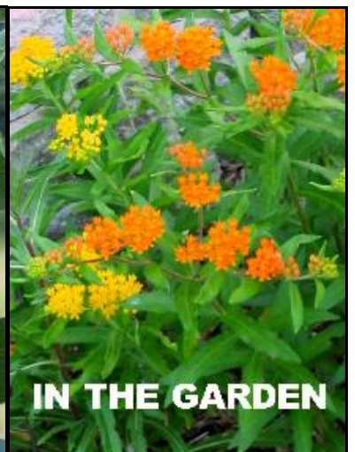
IN THE GARDEN