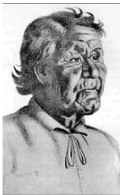
Chief Simon Pokagon

In later issues, I'll share with you some more stories about happenings at Loda Lake before it became a wildflower sanctuary.